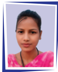
LILIMA DHURUA GTI121CK