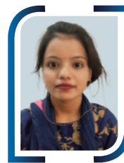
RAZDA PARWEEN CD